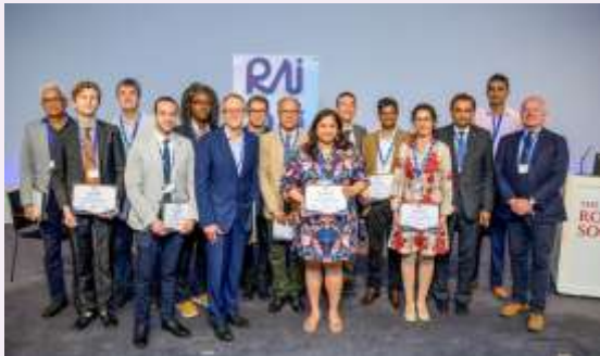
RAI NHS AI CHAMPIONS